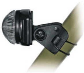
Bike Mount P/N: 49005

Stretch nylon strap that can be used to fasten the Guardian to the arm or wrist, or a multitude of other objects.