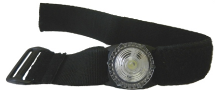
Wrist Strap P/N: 49004

These simple two sided Velcro attachments allow for easy instalment onto the back of helmets for identification and crowd control coordination.