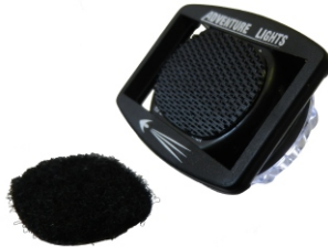
Helmet Attachment P/N: 49002

Clip-on attachment with a magnetic base that adheres to many metal surfaces.