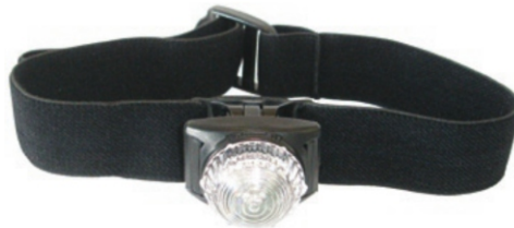
Head Strap P/N: 49006

Allows for easy attachment to most bicycles and poles.