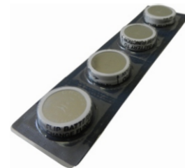
Battery Pack Strip P/N: 49010-S

Comfortable stretch nylon band with adjustable head that can be attached to any Guardian to make an effective head light. Can also be adjusted to fit wrist for hands free lighting.