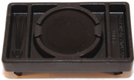
Magnetic Base P/N: 49001

Clip-on attachment with a magnetic base that adheres to many metal surfaces.